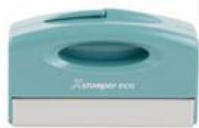
5 – 7 Day Delivery