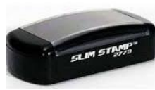
Same Day Delivery