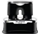
Same Day Delivery