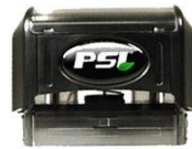
Same Day Delivery